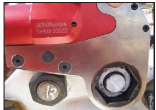
IMPERIAL RATCHET HEAD SELECTION TABLE: