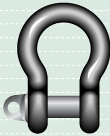
S-2761 E-2761 G-2761