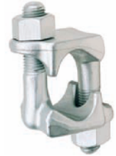
3/16" - 5/8"