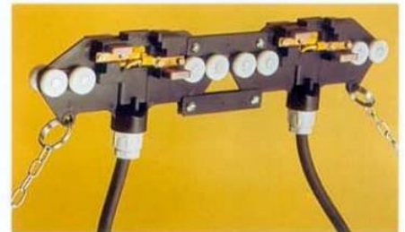
Ref. TO-4x70 A