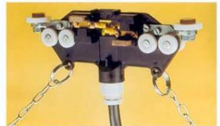
Ref. TO-4x35 AC